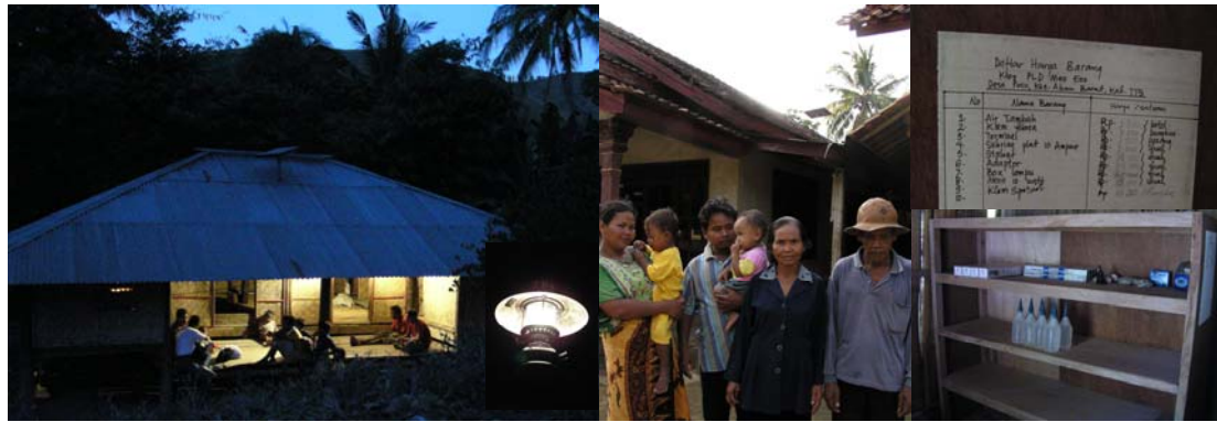
Figure 4. (Left) A 50 Wp SHS module installed on a house roof in Hangaruru Village, East Sumba. This module is not operational, it is the petromax lamp shown on the inset which actually illuminates the house. (Middle) An old couple in Padasuka Village, Lampung, who have owned their SHS for 14 years, accompanied by their children who also have SHSs installed in their houses. (Right) SHS spare parts and consumables, along with the price list, displayed at the PLD office in Pusu Village, NTT Province.

In Padasuka village, Lampung, as mentioned in the previous case studies, the organic market customers preferred not to have the BCR when purchasing SHS. The users found that the BCR was a problem for various reasons: 1) some users called the red light as the time when the battery is 'bankrupt' and were unhappy to wait 1 - 3 days for the battery to be recharged 2) they felt the waiting time was restricting their freedom to get access to their own system. Three users, who have owned their system for 14 years, eventually stop using BCR approximately 4–5 years ago. Other users have since followed their way. According to these people, their batteries lasted for approximately four years. Asked about the battery management, and how they knew the time when the energy reserve in the battery was low, one user replied "that was the time when TV could not be switched on but it's important to have the lights on". It is found that freedom of choice is an important issue in this case as it relates to the energy service availability/continuity.