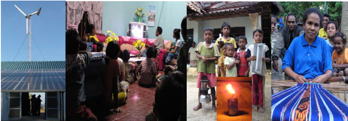
Figure 6. (Left) The E7 PV-Wind-Diesel Hybrid system. (Middle 1) People in Oeledo Village, NTT, watching a TV program in a house that subscribes to the E7 isolated grid AC PV-Wind-Diesel hybrid system. (Middle 2) "Ublik" kerosene wick lamp (inset), as it is called in Lampung, also called "Pelita" or "Tio Oek" in NTT. Kerosene lamps are the domain of children at this age; Padasuka Village, Lampung. (Right) A Weaver of traditional NTT fabrics in Pusu Village.

With an appropriate approach however, PVEC has proved to increase local productivity and quality of life. In Padasuka village, for example, many children are no longer at risk while preparing kerosene lamps, while also having a better quality of light in which to study at night. Two fathers admitted that before having SHS there was always a 'blue' tired feeling when leaving the farm at dusk, only to find the house in darkness and then, if they had a portable diesel generator, of firing it up, and having disputes within the family if the children had not prepared the kerosene lamps.