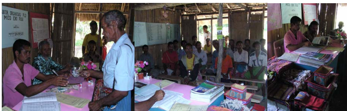
Figure 7. (Left and Middle) Pusu Village, NTT, visited on May 20 th 2005: A SHS user is paying the SHS monthly instalment at the PLD Office; a traditional structure constructed by End Users. The PLD officials were elected from within the End Users. The organisational structure, map of the village indicating SHS locations, the list of End Users and the quarterly meeting schedule, are all displayed on the PLD office wall. (Right) Products of traditional weaving made by local women are exhibited during the payment session.

As stated, accommodation of stakeholders’ interests is of prime importance to maintain PVEC sustainability. As mentioned previously, the payment rate at PLD Pusu is above 95%. This payment rate reflects not only user’s satisfaction with the energy service they obtained, but also the transparency, accountability and their significance as community members because they have their say about their role and have a perception of living in a democratic environment.