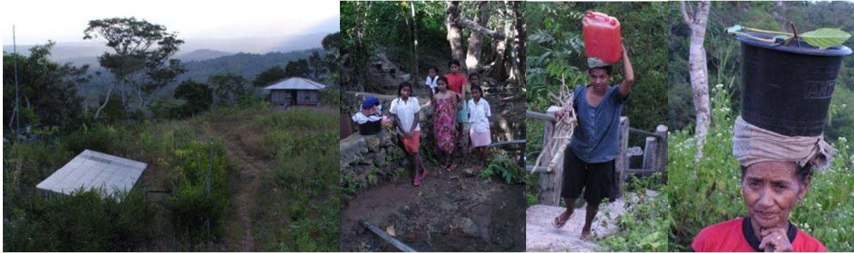
Figure 5. (Left): PVEC for a Water Pumping System in Nusa Village, NTT. (Middle) Standing by the empty pond, these local people have just finished bathing and doing their laundry at the creek. (Far/Right): Local ladies carrying water, and wood, collected from the creek.

With an appropriate approach however, PVEC has proved to increase local productivity and quality of life. In Padasuka village, for example, many children are no longer at risk while preparing kerosene lamps, while also having a better quality of light in which to study at night. Two fathers admitted that before having SHS there was always a 'blue' tired feeling when leaving the farm at dusk, only to find the house in darkness and then, if they had a portable diesel generator, of firing it up, and having disputes within the family if the children had not prepared the kerosene lamps.