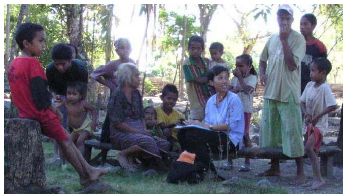
Figure 1. An interview with villagers in the NTT province, Eastern Indonesia, May 2005.

The research project discussed in this paper is a combination of social and engineering research, encompassing qualitative survey work. This research is intended primarily to examine the sustainability of PVEC as a means of rural electrification. The primary objective of the project is to investigate to what extent the existing PVEC delivery models (governmental, commercial, community-based) address the institutional, socioeconomic, technological and environmental dimensions of PVEC sustainability. In this study, these dimensions will be explored through the lenses of accessibility, availability, acceptability and implementational structure and environment of PVEC delivery, defined in Section 3 below. Earlier papers describe the institutional framework for off-grid PVEC applications in Indonesia (Retnanestri et al, 2003), discuss the outcomes of preliminary fieldwork undertaken in late 2002 and early 2003 (Retnanestri et al, 2003; Outhred et al, 2004), and propose the PVEC sustainability examination model (Retnanestri et al, 2005).