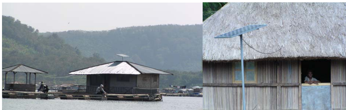
Figure 3. (Left) A 50 Wp SHS, marketed under the WB/GEF project, installed on a hut roof of a fish floating net at Cirata dam, Jangari Village, West Java. (Right) A 50 Wp SHS installed by Womintra 6 in front of a house in the village of Pusu, NTT, Eastern Indonesia Province. The WB/GEF semi-commercial project provided 20% of subsidy to villagers in Lampung, West Java and South Sulawesi. Remote societies in other parts of Eastern Indonesia, as depicted in the picture on the right, require a greater amount of subsidy to own PVEC.

The customers of an organic SHS market 7 in Lampung, also in Sumatra Island, chose to purchase SHS without the Battery Charge Controller (BCR) in order to save approximately $20. This decision was also based, in part, on the villagers' perception that having a controller also raised technical and psychological issues. This issue will be addressed further in the following sub-section. Representatives of two distributors argued that aside from the main purpose of protecting the battery, the BCR is also a significant part of the business. The competing interests, between technical purpose, 'politic' in the business and customers' freedom of choice need to be addressed cautiously.